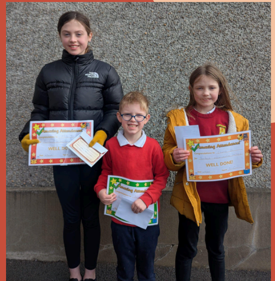
Perfect Attendance – 100 Days!

We also held a Lucky Raffle for those who attended school for 10 consecutive days, and three lucky winners went home with Mr G vouchers!