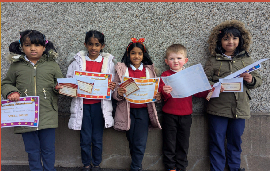
Excellent Attendance – 1/2 days missed